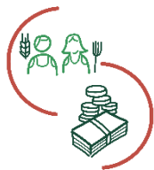
Financial services delivery