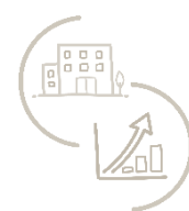
Management systems improvement