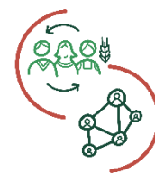
Market access and product development