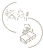
Financial services delivery