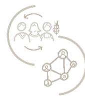
Market access and product development