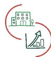
Management systems improvement